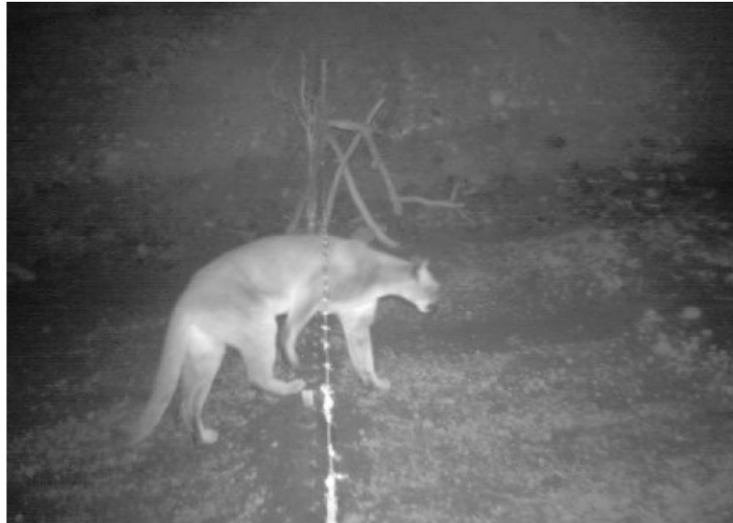
Fig. 4. Cougar passing through hair-sampling system at one of the wildlife underpasses in Banff National Park.

species may be reluctant to use wildlife crossing structures adapted for hair sampling. However, with time, some animals appear to adapt to them and use them regularly.