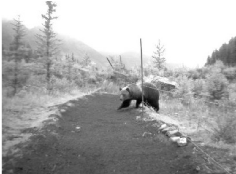
Fig. 3. Grizzly bear passing through hair-sampling system at one of the wildlife overpasses in Banff National Park.

(Mansergh and Scotts 1989, van der Ree et al. 2009). There is a need for additional evidence-based support that wildlife crossing structures contribute to long-term persistence of wildlife populations. Over 12 years of data collected in Banff have shown that many large mammal species such as black and grizzly bears use the wildlife crossing structures each year, but until now the number of individuals and their sex have remained unknown.